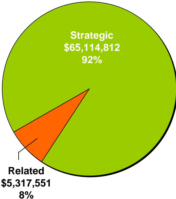
Strategic vs. Related Grant Making